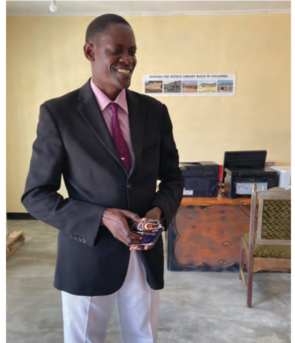
Above, the Manager of Port Authority in Chilumba where CHW office used to be located visits the new library.