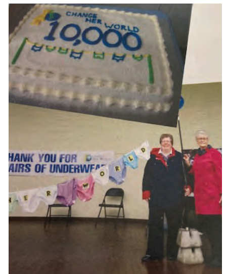
Celebrating 10,000 in 2014.