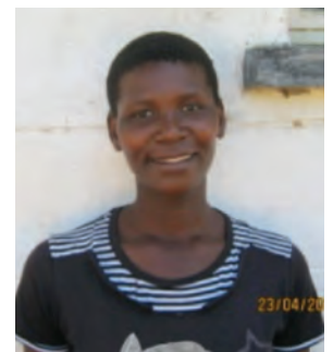
Gift in 2012 as a CHW beneficiary.