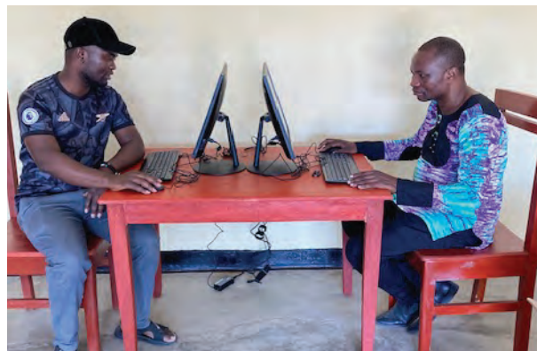
Setting up the new library computers.