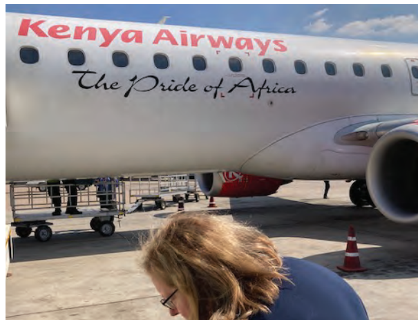
Arriving in Malawi after some long travel days.

There is much more to share so be sure to come to the Annual Dinner , April 13, 2024 at the Best Western Arden Park.