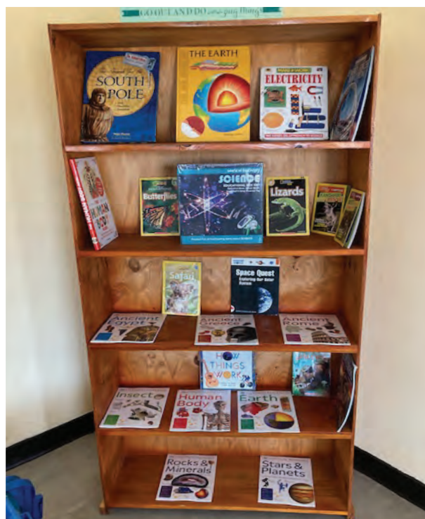
One of the new bookcases in the new library.