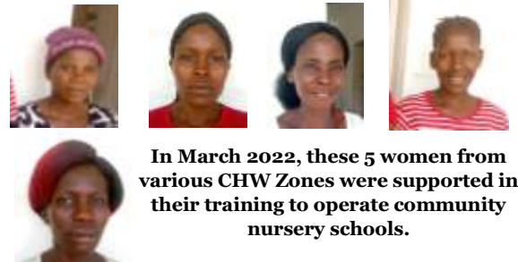
In March 2022, these 5 women from various CHW Zones were supported in their training to operate community nursery schools.