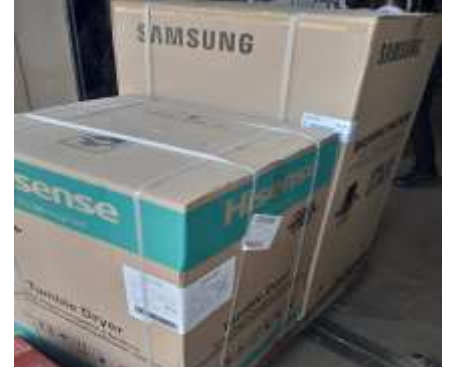
Washer and dryer arrives at the Chilumba Rural Hospital

He sincerely thanked you the Directors for the timely donation. Furthermore he continued by requesting that if they may be some possibilities to buy them extra linen as they have less in stock to support the number of patients they daily face.