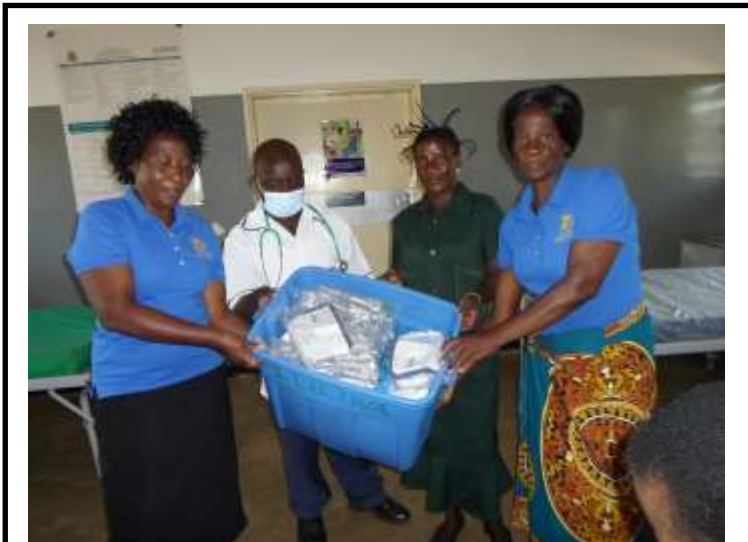
Valuable medical supplies are distributed to rural health centres in the Chilumba region by the Change Her World Committee.

We are now waiting for funds to ship over 2500 children's story books to our library in Chilumba. We are also hoping to begin purchasing children's tables and chairs, floor mats, bookcases, computers and adult tables and chairs once sufficient monies are available. Thank you to all those who have made donations to allow this building to become a reality in Malawi!