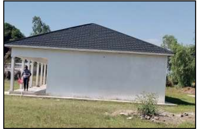
The Chilumba Community Library Build Is Finished!!!