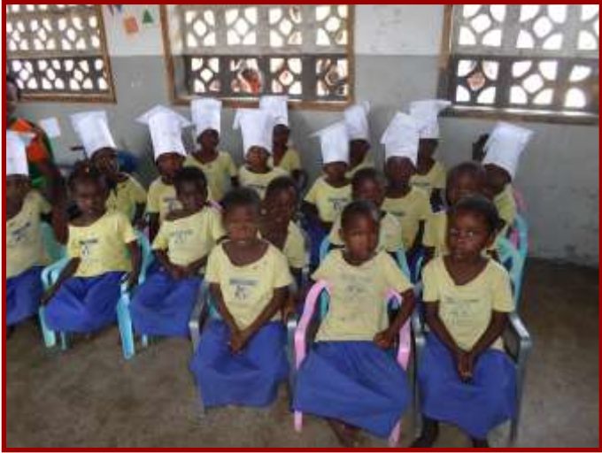
Above are the nursery school graduates (with white hats) in the Fall 2022, along with other students who will continue this year. Observe the condition of the uniforms after three years of use.