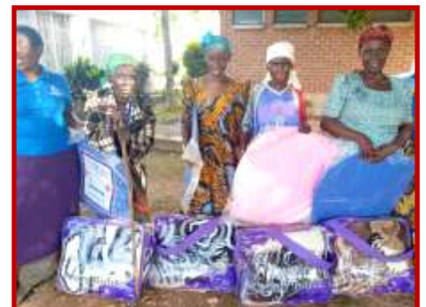
Vulnerable women receiving blankets and mosquito nets from CHW.