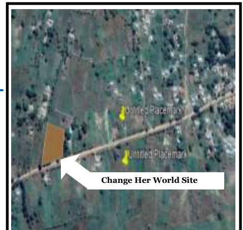
On Google Maps: The Change Her World land—3.7 acres purchased two years ago. It is on this site that the library is being constructed.