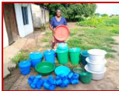
Plastic pails and cups recently purchased to help with the feeding program at the CHW nursery school in Chilumba.