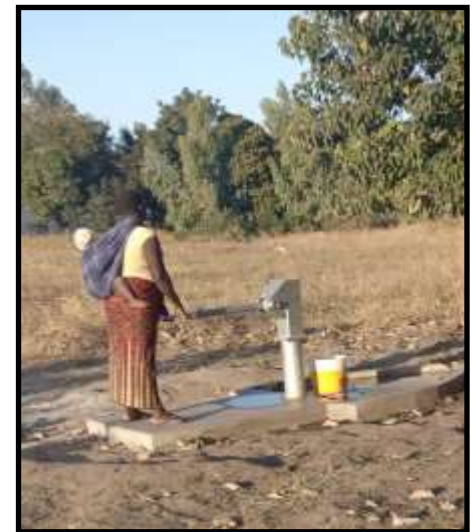
Above: The newly constructed borehole well.