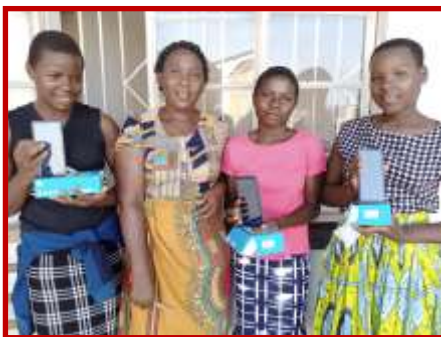
CHW students receive smartphones to assist in their learning at Karonga Secondary School.