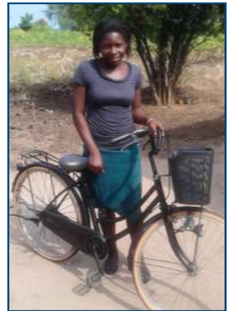
A Facebook post requesting funds for five bicycles was filled in three hours! Thank You!