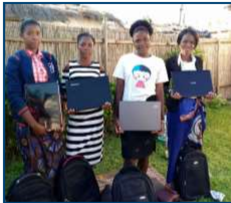
CHW university students in Mzuzu/ Ekwendeni Project receive much needed laptop computers to continue their studies online.