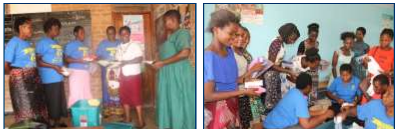
Left: Medical supplies being delivered to a clinic in the Chilumba area. Right: CHW university students receiving reusable sanitary protection kits.