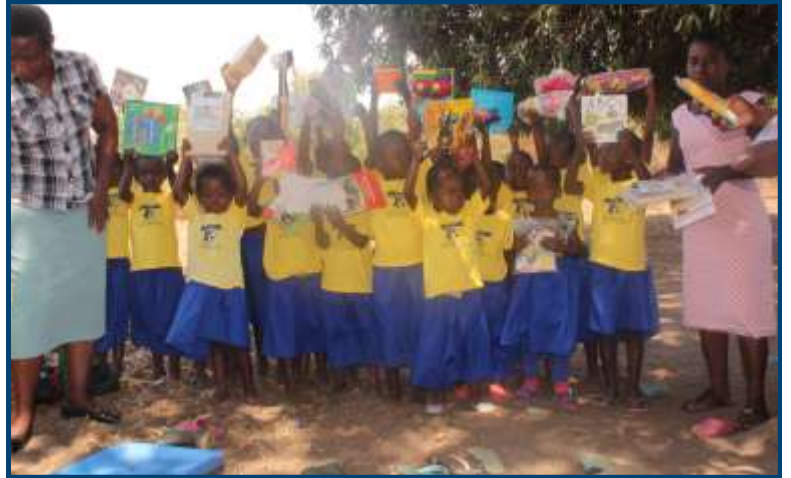
Left: The pig project in Chilumba is thriving! There is a possibility of another such project coming soon! Top: CHW Nursery School students dressed in new uniforms and holding up toys and teaching supplies recently shipped from Canada.