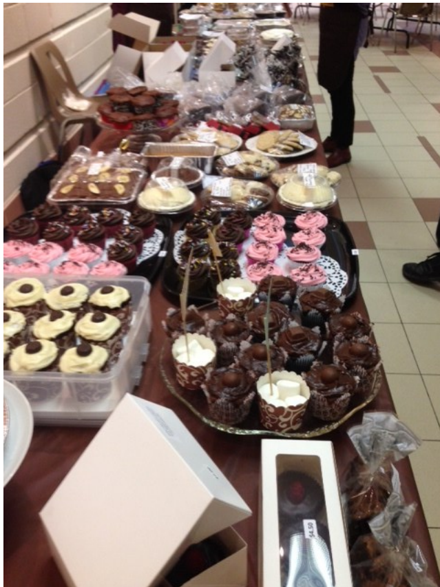
A fantastic display of baked goods ready as the doors opened on November 2 at the 5th Annual CHW Chocolate Extravaganza!

Mark your Calendars! 6th CHW Chocolate Extravaganza Saturday November 7, 2020!