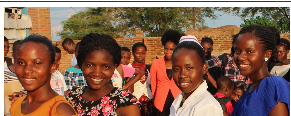
Some of the CHW tertiary students who attended and/or shared at this seminar!