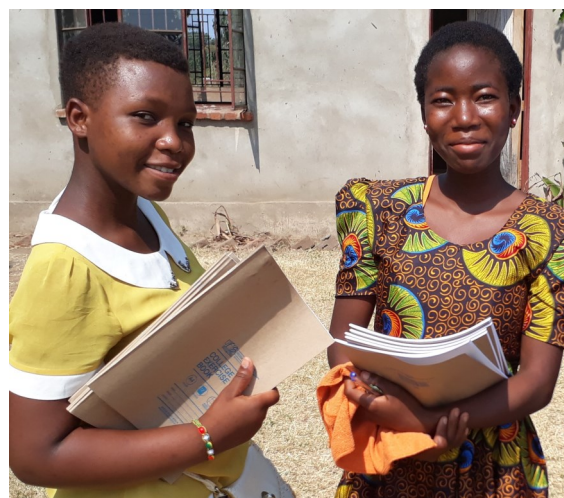
Two Change Her World secondary students preparing to return to school in September 2019.

Special guests, who have continuously and generously supported our work since its inception, will be invited and acknowledged during the evening. Supporters from Ontario, Western and Eastern Canada, and New York will also be in attendance. There will be an outstanding silent auction and 10 door prizes (as opposed to 3) in honour of it being the 10 year celebration. There is no limit to the excitement and gratitude that permeates our present thinking as we look toward this milestone. Please plan to join us!!!