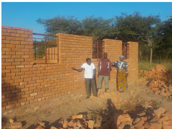
Girls hostel at Thimalala in the construction process.

With the exceptions of doors, some window panes and finishing up the pointing and drainage requirements, the construction of both Thimalala and Thunduti hostels is very close to completion. These have been significant projects to meet a pressing need. Girls often walk long distances to secondary school which puts their safety at risk and tires them before starting their classes. They