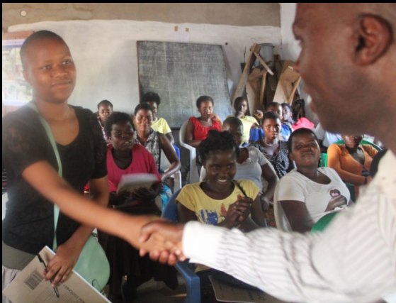
A CHW girl being honoured in the Fall 2018 for the highest academic achievement in her school!

Please consider making a monthly donation to this charity to assist in this need!