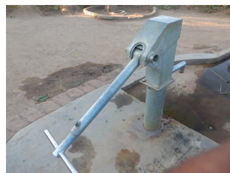
An example of what the well will look like once it is completed.