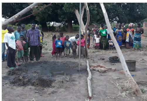
Site in Chimphinga Village where the well is to be located.