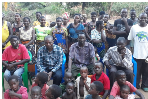
Community gathering as the well proposal is explained in Chimphinga Village