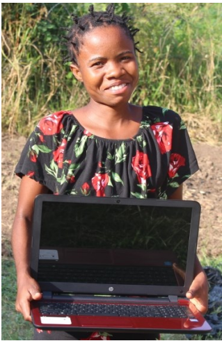
Following an appeal at the CHW Annual Dinner in April, 13 computers were obtained for post-secondary students.