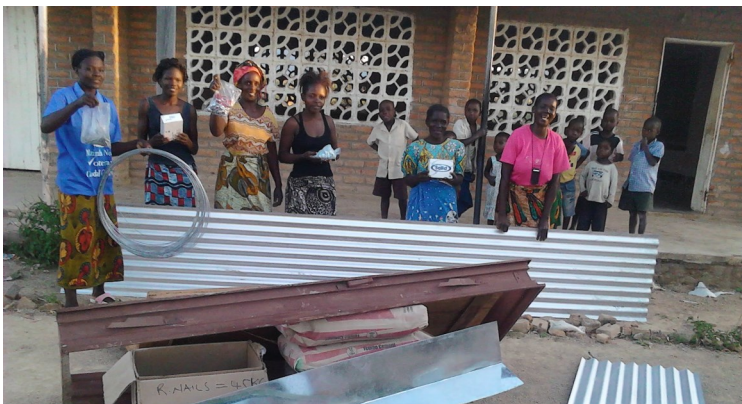
Supplies recently purchased through donations to complete a female teacher's house.

University costs including fees, lodging and transport, average $2,500.00 per year.