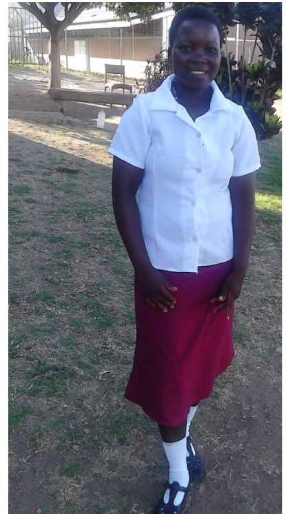
A CHW Secondary School student proudly showing her family her new school uniform! For many, this is the first time they have ever owned shoes and socks.

Girls who are boarding are provided with transportation money which enables them to go home for holidays as well some pocket money ($20.00) per month. With all necessities taken into account, the average cost per girl would be $375.00 a year . This does not include a bicycle if needed at a cost of $125.00 or in some cases extra nutritional support which will add another $30.00 per month. Some variances exist in the pricing of items between the two projects. School uniforms/shoes are replaced every other year.