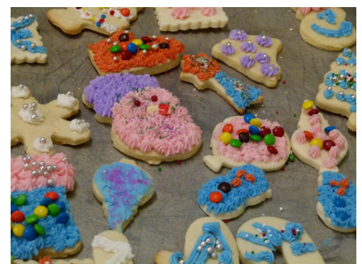
Children Baked and Decorated Cookies at St Marys Presbyterian Church for Change Her World