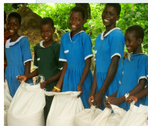
Below: Grateful smiles on the faces of Change Her World girls.