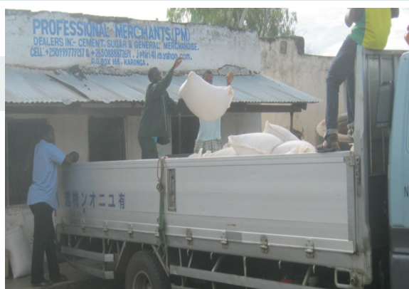
Above: Maize being loaded in Karonga for distribution.