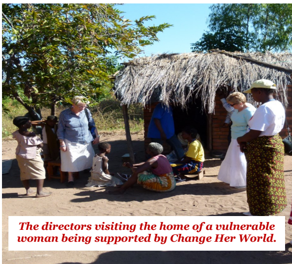
The directors visiting the home of a vulnerable woman being supported by Change Her World.

In the afternoon, we met at our CHW office with members of the Chilumba Project Committee to sort through some of the shipment items and make arrangements for the distribution of many of these things during our time out in the zones.