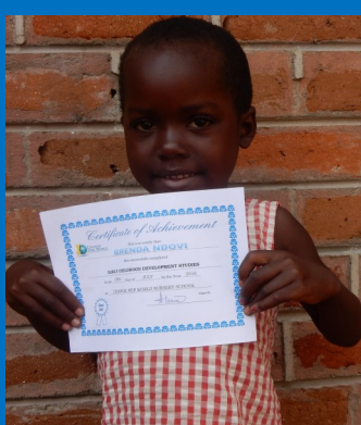
A proud CHW nursery school graduate!