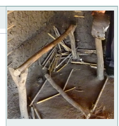
Above: This serves as a teacher's desk and chair in a primary school in Chilumba.

Below: Primary school girls in Ekwendeni supported by Change Her World. They are wearing their new uniforms.