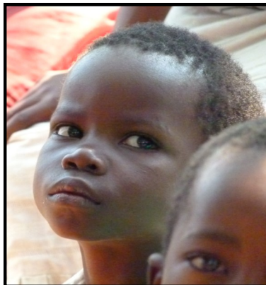
What do you see in her eyes?