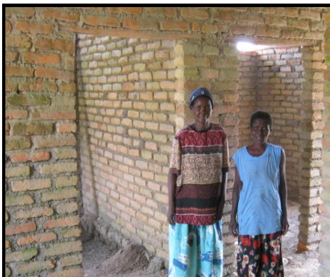
The home of a female teacher needing a cement floor