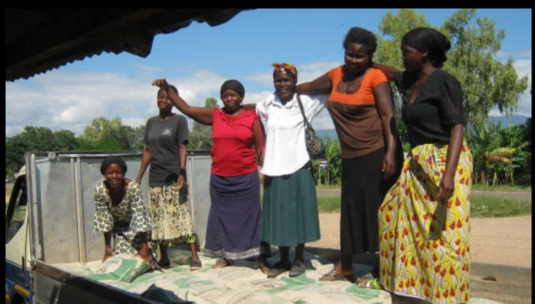
Prayers answered! The cement is on its way!