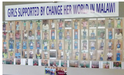
Photos of the 103 girls currently supported by the charity were proudly displayed.

Freedom is not just about political liberty. It is also about economic independence and the power of choice.