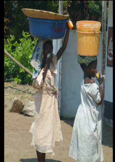
More work for the girls