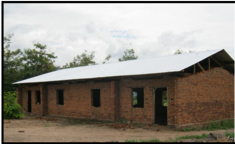
A new school roof