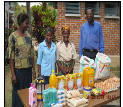
Diet supplements for a sick Change Her World girl