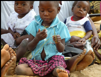
Hope for the girl child... the work of Change Her World