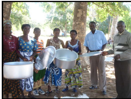
Cooking Pots to provide a noon meal

There is no passion to be found playing small, in settling for a life that is less than the one you are capable of living.