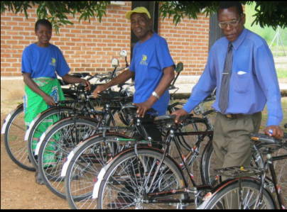
Bicycles purchased for the Project Committee Office and Zone Committee Volunteers