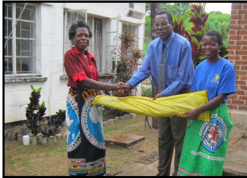
Plastic sheeting for a leaking roof!