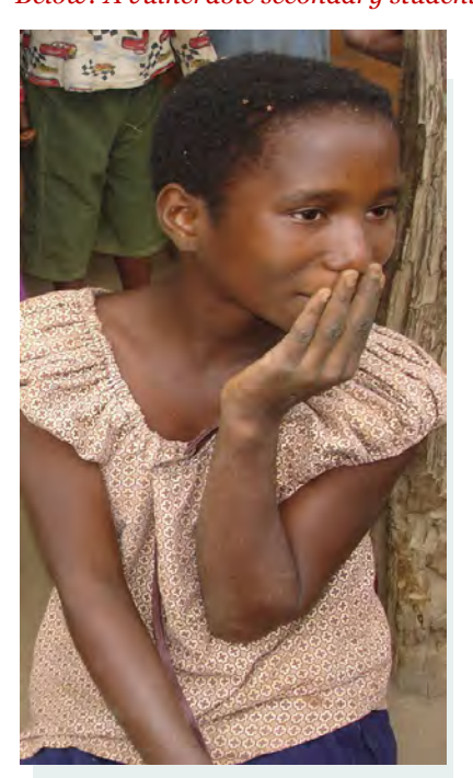
Above: A primary student in need Below: A vulnerable secondary student